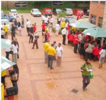
When some staff heard about the fire, they burst into tears. They could hardly believe it when they arrived at work on Monday and were ushered into their fully equipped, temporary HQ.

In the early hours of Saturday morning, January 17 this year, Tracker's senior management was woken up with the horrifying news that their head office building was on fire. Members of the team raced out to the scene and watched in disbelief over the shoulders of the emergency services teams, as their head office was destroyed by the blaze. But instead of watching helplessly as their home of many years was reduced to a pile of charred rubble, the fire sparked the most remarkable few hours in Tracker's history.