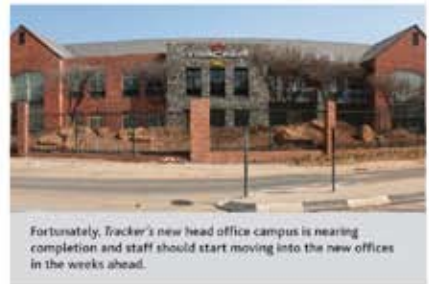
Fortunately, Tracker's new head office campus is nearing completion and staff should start moving into the new offices in the weeks ahead.