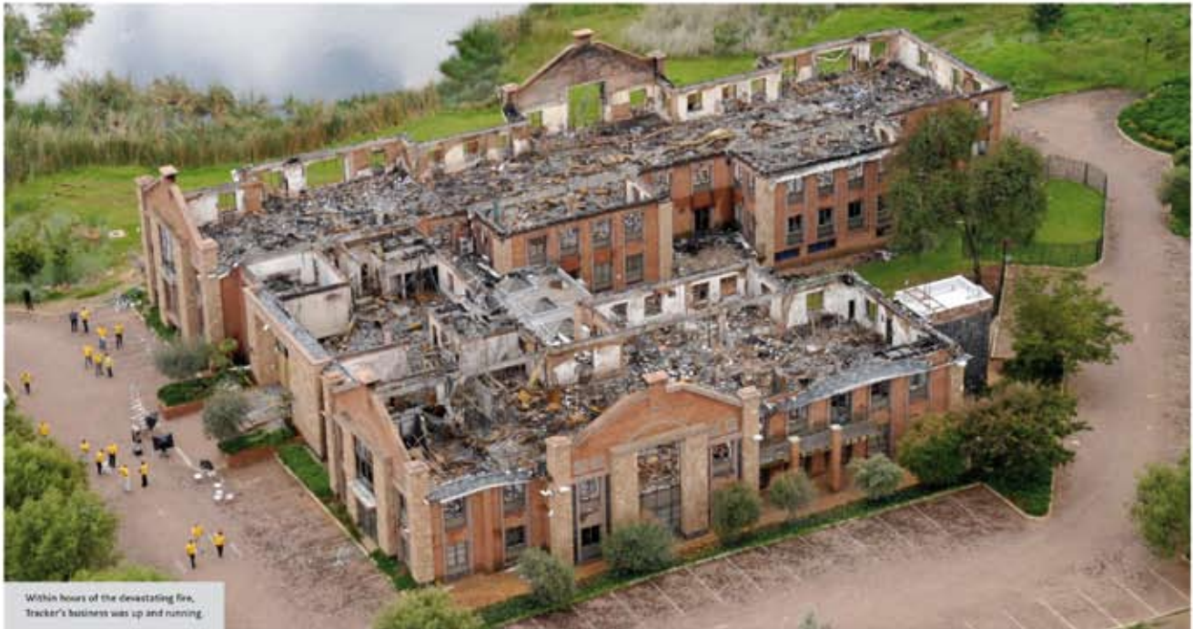
Within hours of the devastating fire, Tracker's business was up and running.