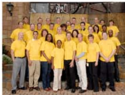
As the fire raged on, the Disaster Recovery Team was already executing their recovery plan. By daybreak all critical business systems were up and running.

"We are exceptionally proud of our people because even with the best Disaster Recovery Plan, implementation is not possible without very special people. That we have emerged from what was potentially a business-crippling event with barely a scorch mark is nothing short of phenomenal. An insurance assessor commented that he had never before seen a recovery plan executed so well and with such precision, following such a major catastrophe. We are also very happy to report that our Emergency Control Room is located in another building and was not at all damaged by the fire. In fact, as the flames raged on, we recovered almost half a dozen stolen and hijacked vehicles around the country."